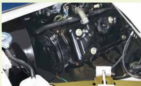
New EFi Engine.