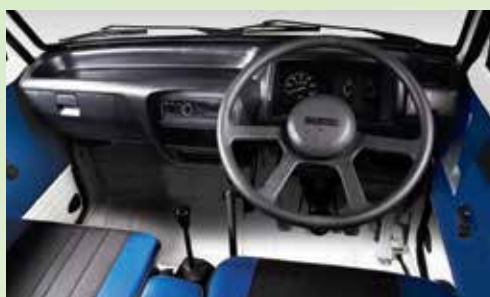
Newly designed instrument panel with New 4 spoke steering.

With upgraded features and advanced Euro-II technology, now your Suzuki Bolan is more environment friendly. Now drive the extra mile, with high standard engine performance in low fuel consumption and inexpensive maintenance that let your savings augment in an economical way!